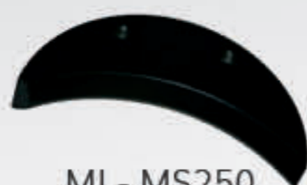
MI - MS250