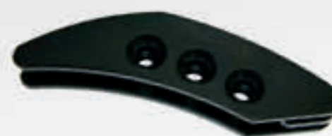
GB - GS170