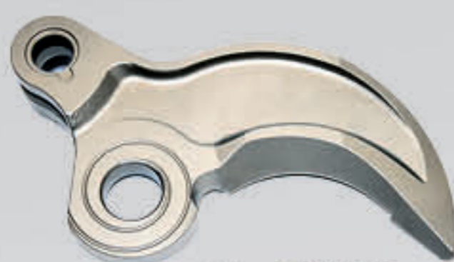
SJ - MS250