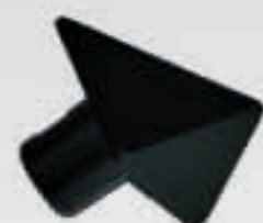
CT - CC300