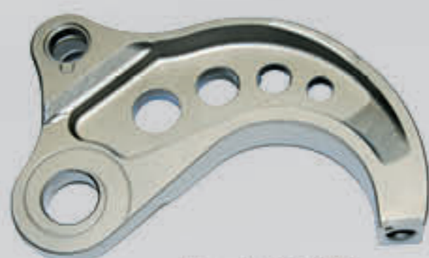
SJ - CC300