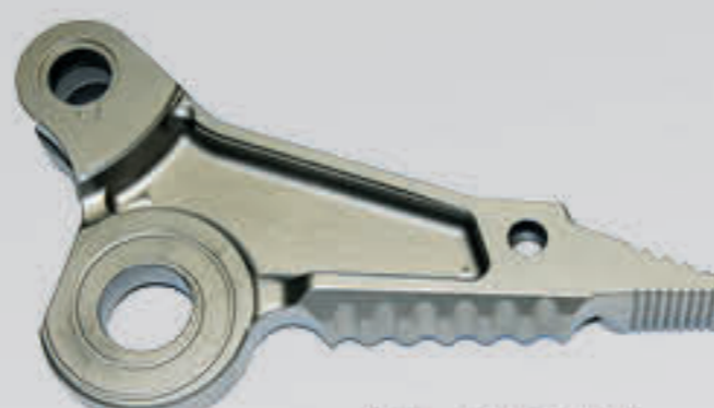
SJ - CS350