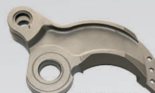
SJ - GS170